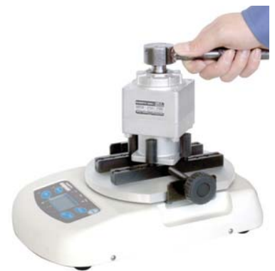
TNP Digital Torque Meter