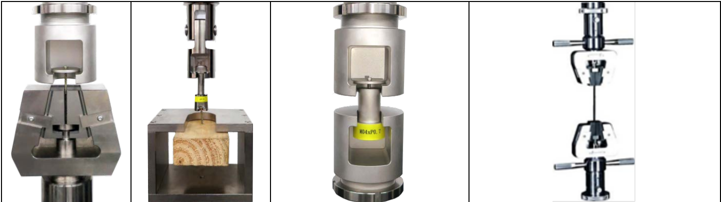
Tapping screw- Tensile